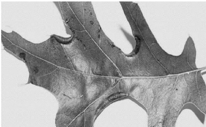
Figure 1. Infested oak leaf.

In the Midwest, oak leaf itch mites emerge in late July and continue through the summer. Bite problems intensify in the fall with increased gardening activities, mainly the handling of mite-infested leaves (Figure 1).